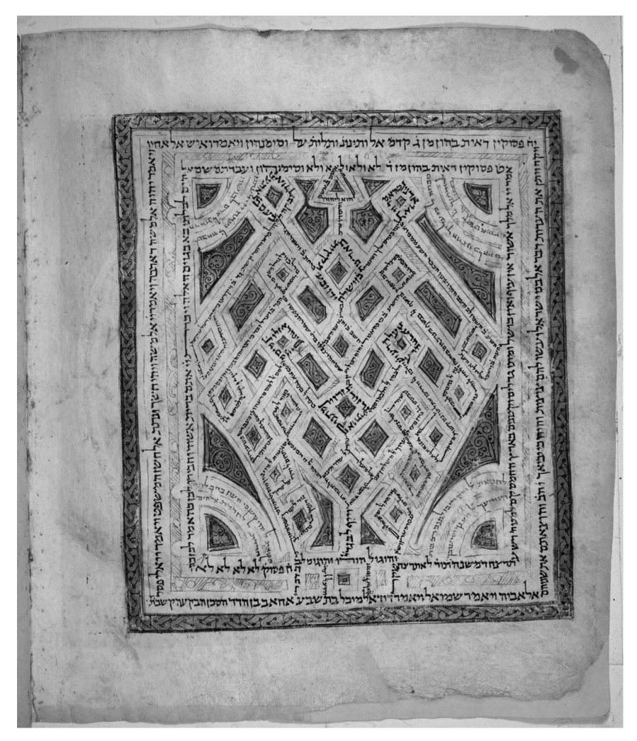
Figure 2. Leningrad codex, f. 474v

dot (right) and once with samek <sup>47</sup> forming part of the Magen David; (ii) a list of 9 pairs of words that appear once written with yod at the end