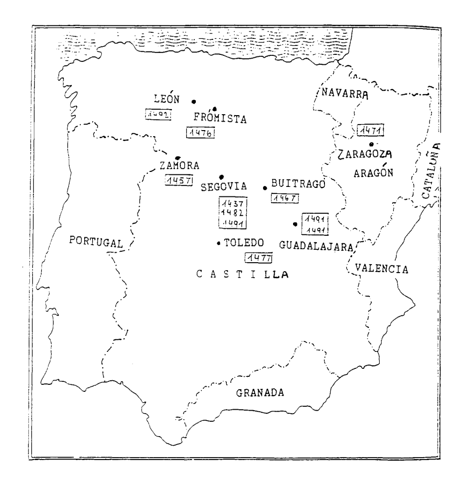
Map of yeshivot and years in which manuscripts were copied