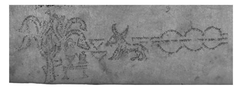
Figure 6: MS Vatican, BAV, Vat. Ebr. 14, f. 17r (bottom of the folio).

The biblical passage in fol. 17r goes from Gen. 17:23 to 18:8 (i.e., the beginning of Parasha Vayyera in Gen. 18:1).