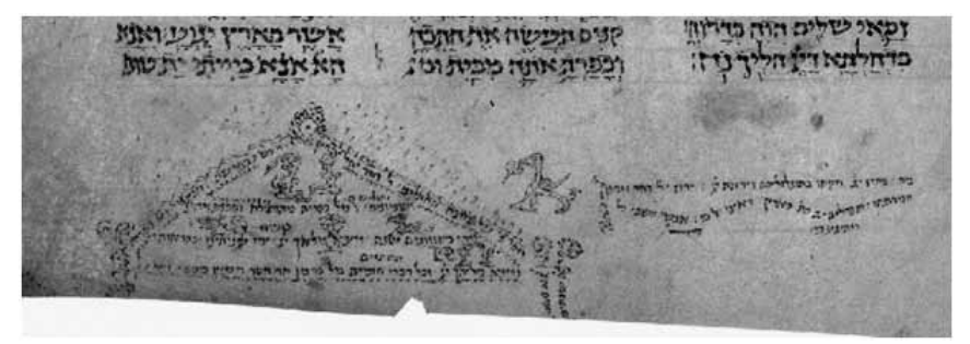
Figure 2: MS Vatican, BAV, Vat. Ebr. 14, f. 7r (bottom of the folio).

The biblical text in the folio 7r continues from Gen. 6:6 to 6:17 (beginning of Parasha Noah 6:9).