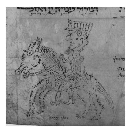
Figure 5: MS Vatican, BAV, Vat. Ebr. 14, f. 12r (bottom of the folio).

The biblical passage in fol. 12r is from Gen. 11:23 to 12:4 (i.e., the beginning of Parasha Lekh lekha in Gen 12:1).