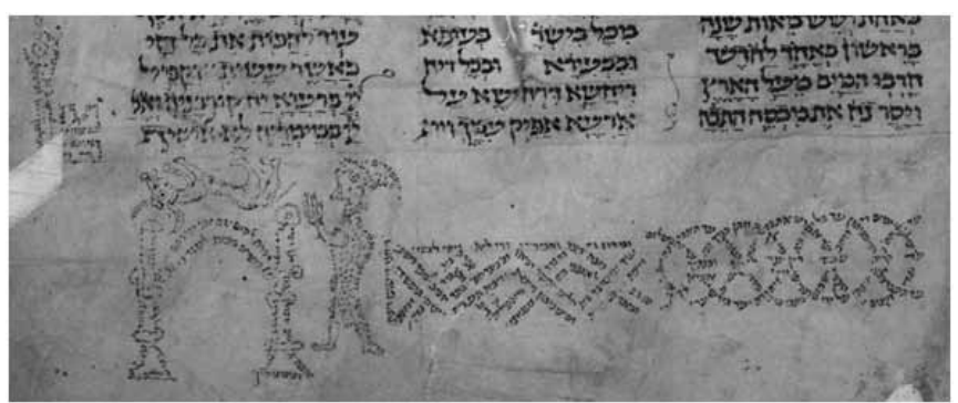
Figure 3: MS Vatican, BAV, Vat. Ebr. 14, f. 9r (bottom of the folio).

The biblical text on fol. 9r displays the verses running from Gen. 8:10 to 8:21.