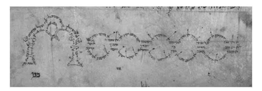
Figure 4: MS Vatican, BAV, Vat. Ebr. 14, f. 16v (bottom of the folio).

The biblical passage in fol. 16v is from Gen.17:10 to 17:23 (end of Parasha Lekh lekha ).